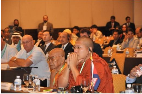
World Peace Congress 2010, Thailand

OCTOBER 19 TH TO 20 TH , WATERFORD, IRELAND TOPIC: UNIVERSAL DISARMAMENT