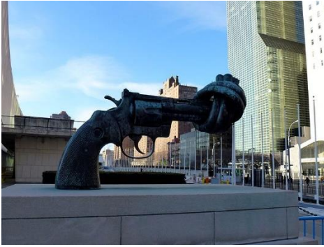
"Non-Violence" by Carl Fredrik Reuterswärd, in front of the UN headquarters in New York City